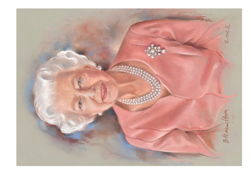
AI 594 x 841 (mm)

Giclee printing is the preferred and most popular choice for museums and art galleries.