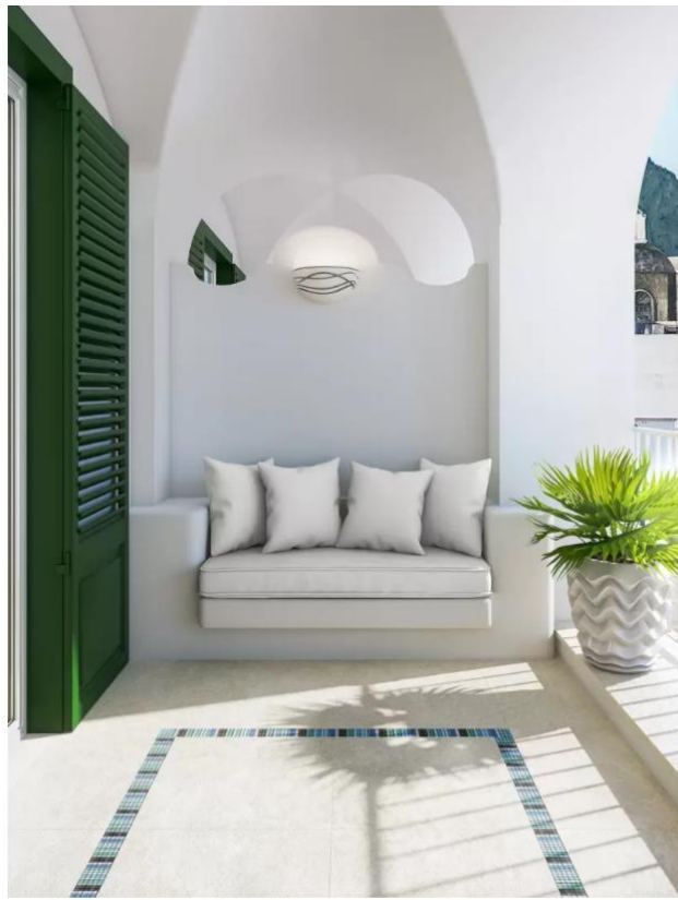
A RENDER OF A TERRACE AT ONE OF THE HOTELS ROOMS

Those summer nights, as the Piccola Marina swirls with ambling crowds, soft lights and sweet nothings. It's a gentle, hand-holding, ice-cream-licking atmosphere down at La Piazzetta, which is also home to Bar Tiberio - the best spot for an aperitivo. Then, of course, there are the island's architectural wonders, like Casa Malaparte (the fabulous modernist house that features in Jean Luc Goddard's classic Le Mépris with Brigitte Bardot) and over in Anacapri, the glorious gardens or Villa San Michele. Or those sea views, particularly from La Fontelina beach club for the best front pew to admire the Faraglioni rocks, not to mention the best zucchini frites in the world. Or for that matter, the romantic wonder that is, Le Grotelle for the mozzarella grilled in lemon leaves and a dreamy terrace that really comes into its own at night time.