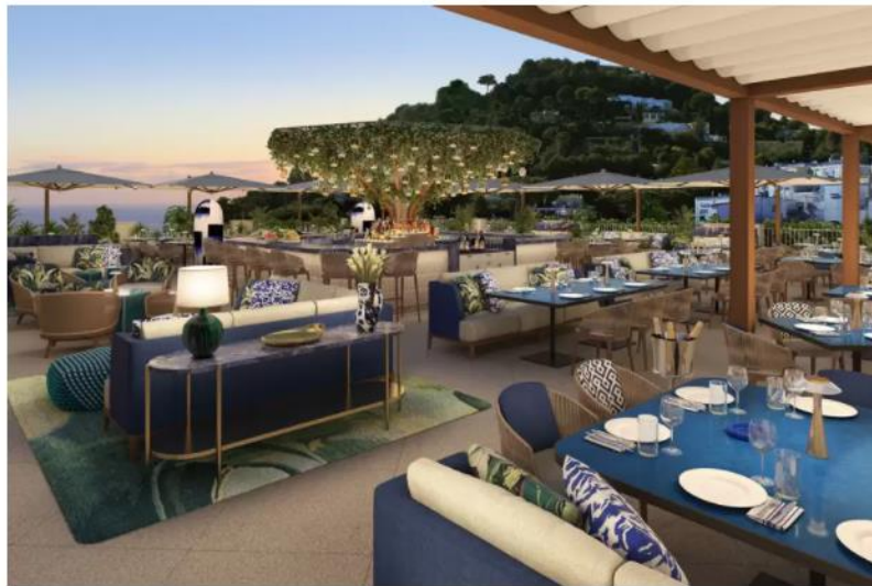
A RENDER OF BIANCA, THE ROOF TOP RESTAURANT

There hasn't been a hot new hotel opening of note on Capri since J.K.Place launched their fabulous slick boutique property back in 2008. So it was a very clever move by the hotel group Oetker Collection (whose lavish portfolio of properties include The Lanesborough, Le Bristol and the infamous Hotel du Cap-Eden-Roc) to open their first Italian property on this mythical island, although we will have to wait until Hotel La Palma opens its doors in April 2022. Indeed, this is Capri's first (and oldest) hotel, built in 1822, which will no doubt see it returned to its gloriously, unapologetically hedonistic best by Oetker Collection and owners, Reuben Brothers. During La Palma's extensive face lift, the hotel's room count is being drastically decreased from 80 to 50 rooms – including 18 suites – each complete with its own private balcony or terrace. The property's interiors are being transformed by two acclaimed architects: led by Rome-based Francesco Delogu of Delogu Architects for the rooms and lobby, and New York-based Tihany Design for the restaurant, pool, spa, and beach club.