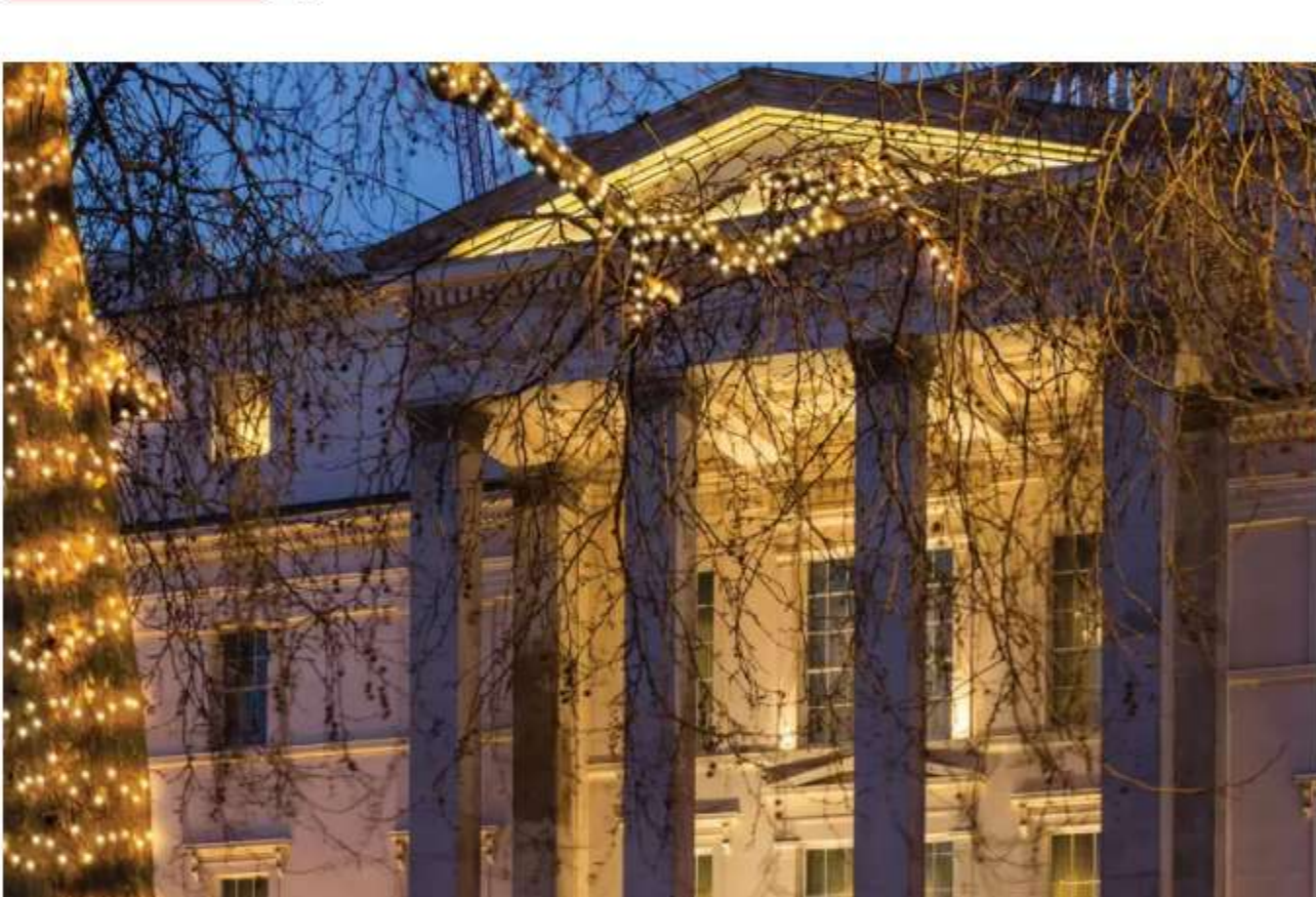
THE LANESBOROUGH EXTERIOR

The 'Staycation' package at the Lanesborough starts from £735 per night. Visit oetkercollection.com to find out more