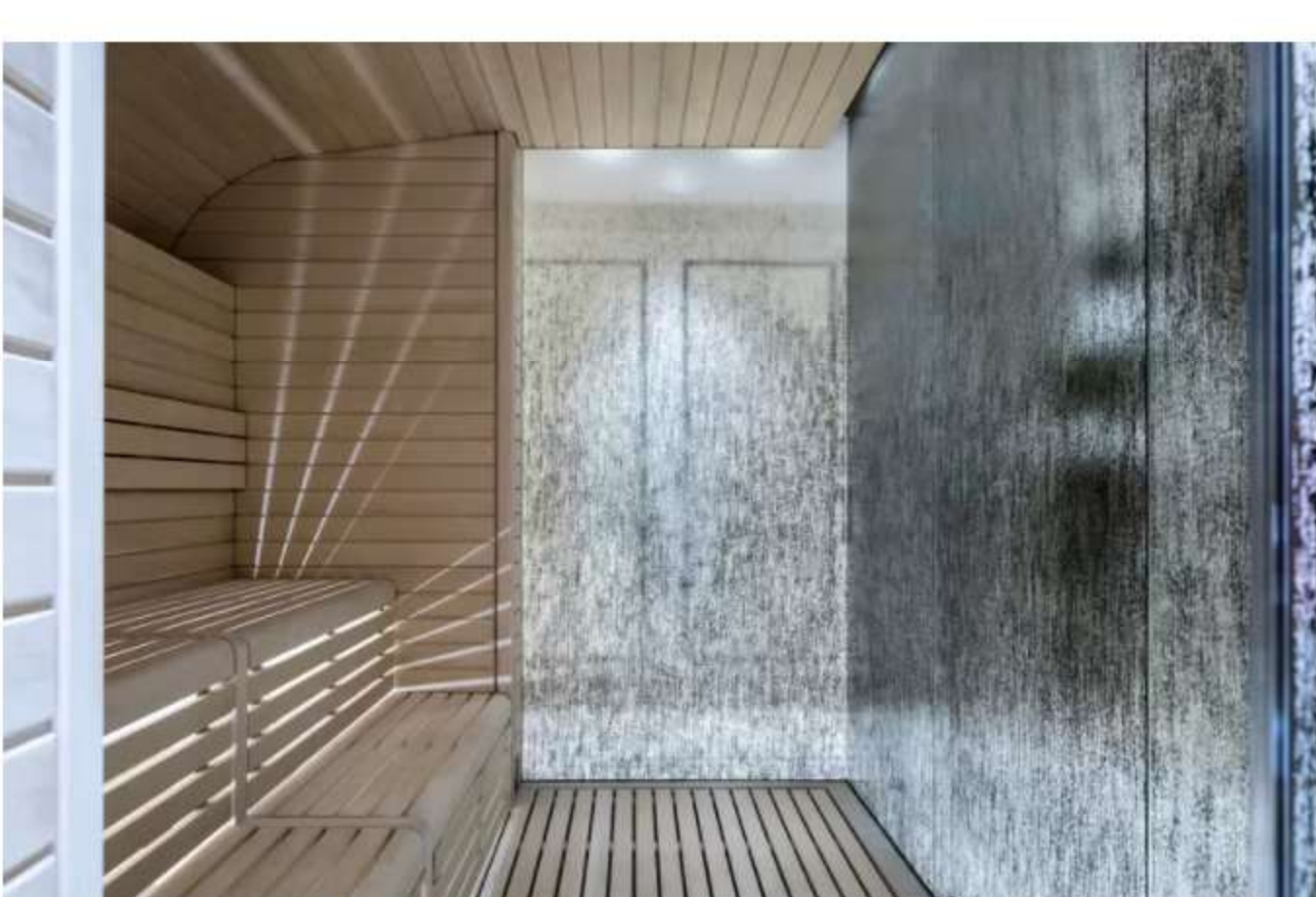
THE SAUNA AT THE LANESBOROUGH SPA

Elsewhere, you can enjoy fine cigars and centuries-old cognacs and whiskies – you could even fork out £10,000 for a dram of whisky if you wanted. For those seeking indulgence elsewhere, the charming staff in the spa (a gilded, mosaic-floored, extravagantly grand space) can sort you out. In the silvery, temple-like treatment rooms, a talented team of therapists aim to heal your soul as much as your body, asking about your emotions and mental state before a relaxing massage with all-natural oils by ILA.