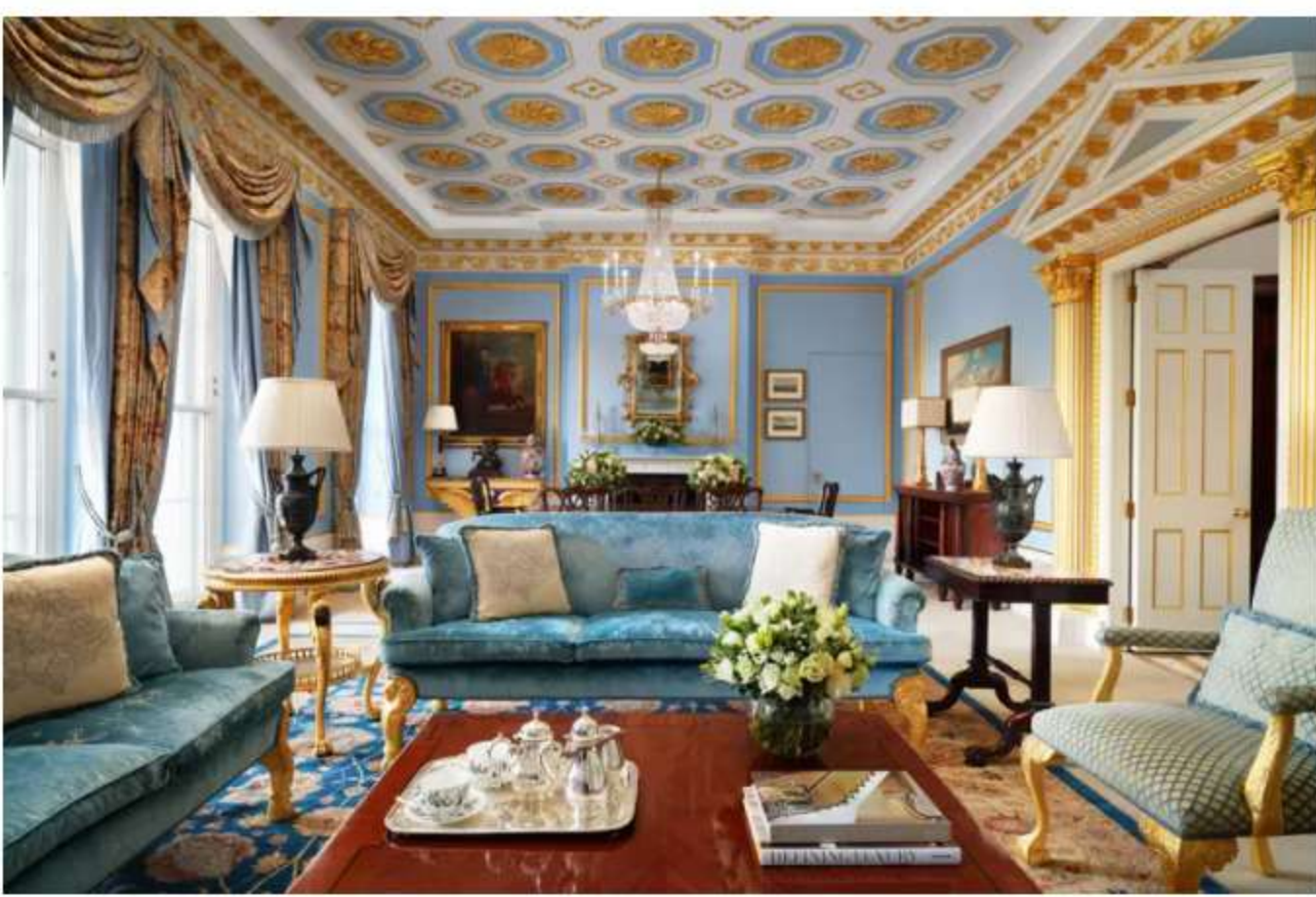
THE LIVING ROOM IN THE ROYAL SUITE

Having opened briefly in October, the Lanesborough has flung its doors open once again – and clearly, the staff, grinning behind their crown-embazoned masks, are just as delighted as guests to be back. Just ask your personal butler; every room has one.