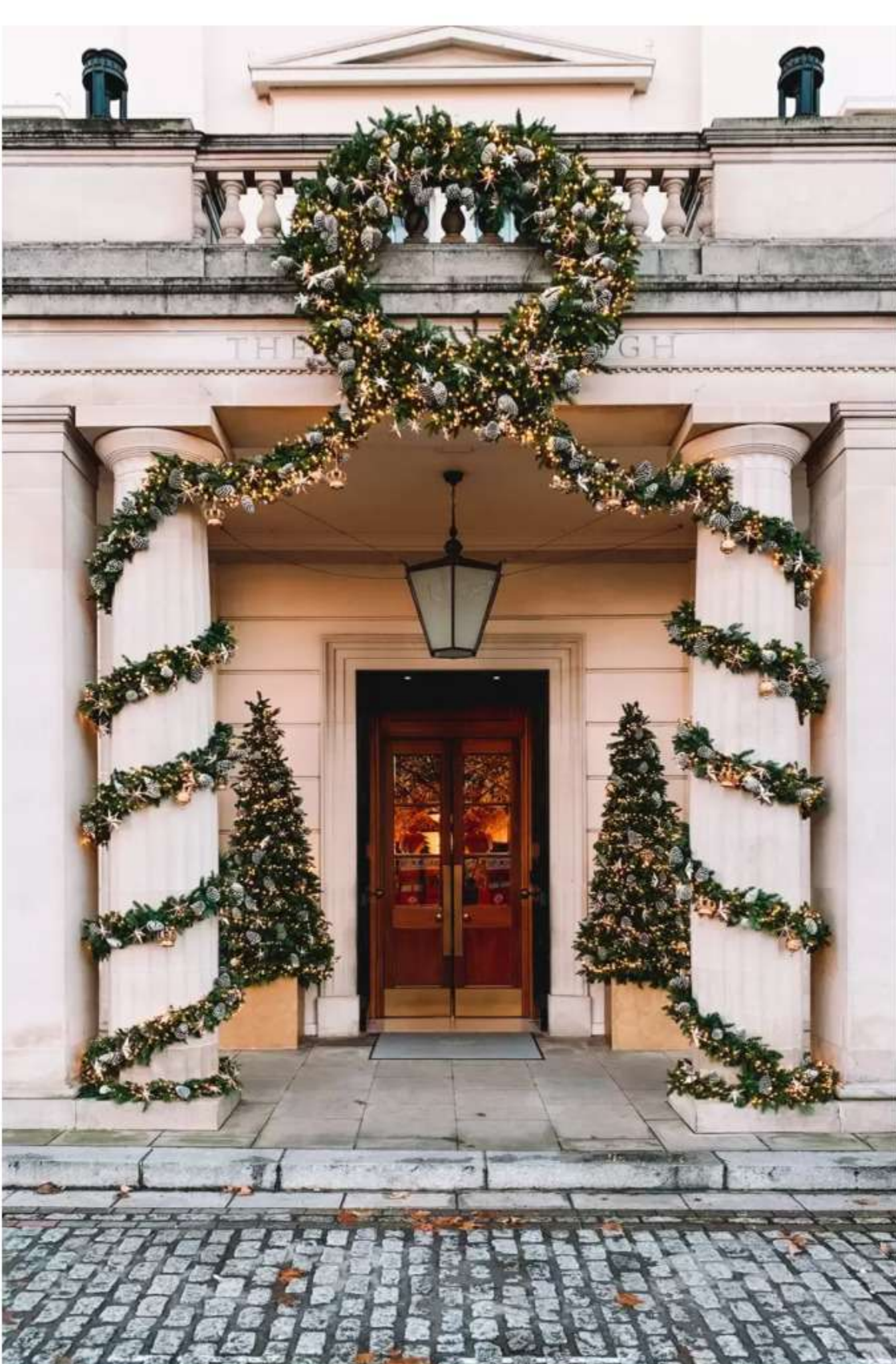
CHRISTMAS DECORATIONS AT THE LANESBOROUGH ENTRANCE