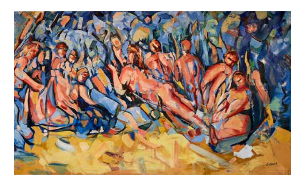
The 'Resonant Bathers'