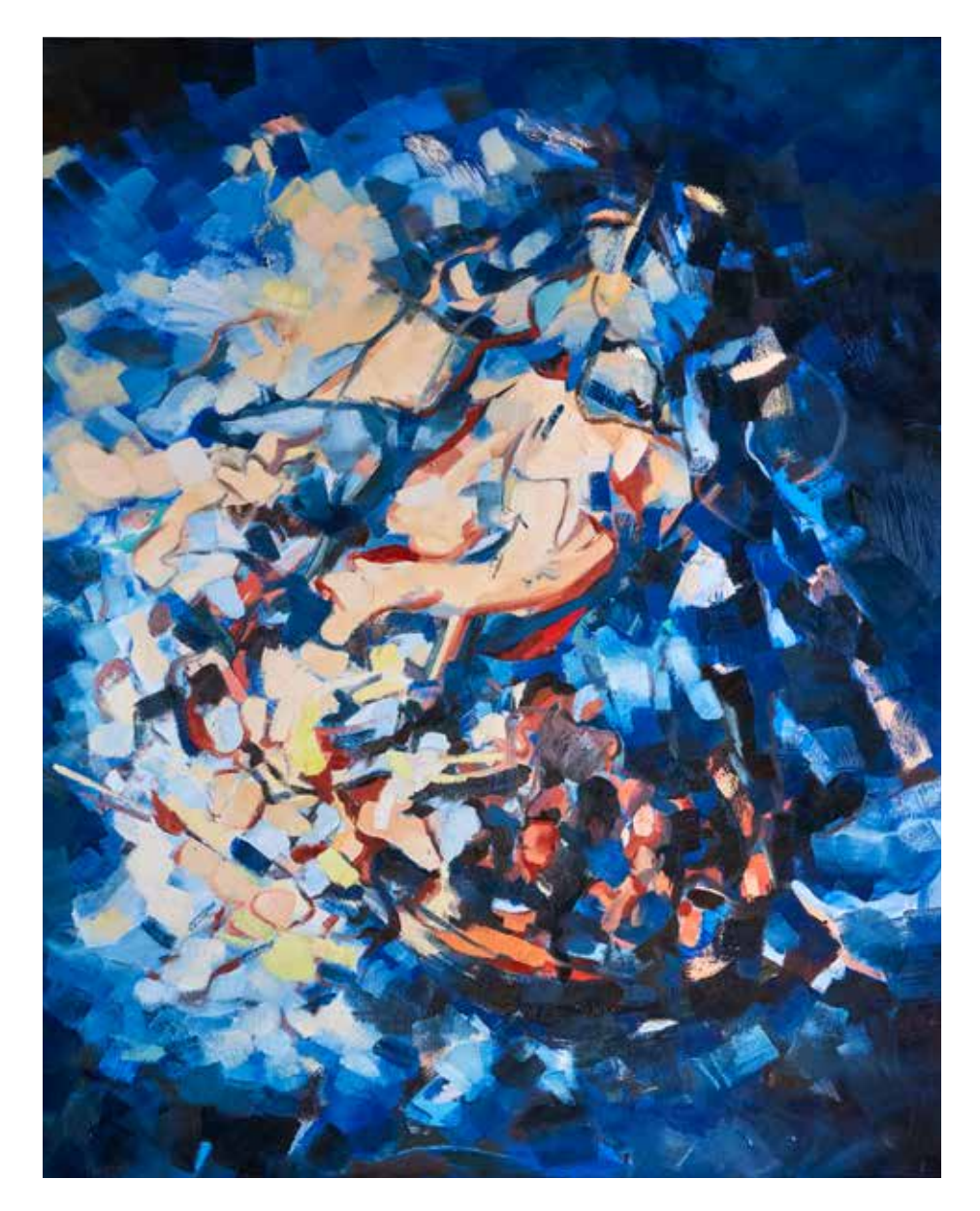
Beyond the Tempest